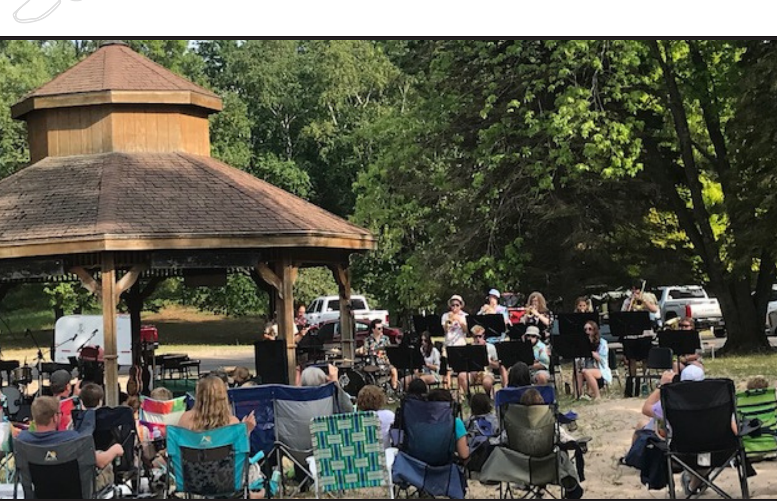
Local student group, Pier Pressure, performs to a crowd as part of the Music Sparks Meaning Summer Sun Sets concert series on the 4th of July weekend, 2023.

Music has the power to transcend language and cultural barriers, bringing people together in a shared experience. Whether it's the rhythm that moves our bodies, the lyrics that touch our souls, or the melody that lingers in our minds, music has a unique ability to evoke emotions and memories. It can inspire us, comfort us, and motivate us to action. Music has been an integral part of human culture for centuries, and it continues to play a vital role in our lives today. From classical compositions to contemporary pop hits, the diversity of musical genres reflects the vast array of human experiences. Whether you're a musician or a fan, a casual listener or a devoted enthusiast, please never forget the power of music to bring us together and enrich our lives.